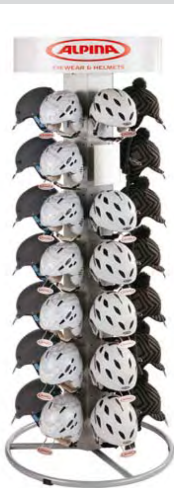
Helmetdisplay 41 pcs A0002.0.28 230 x 90 x 90 cm incl. 41 metal hooks and mirror