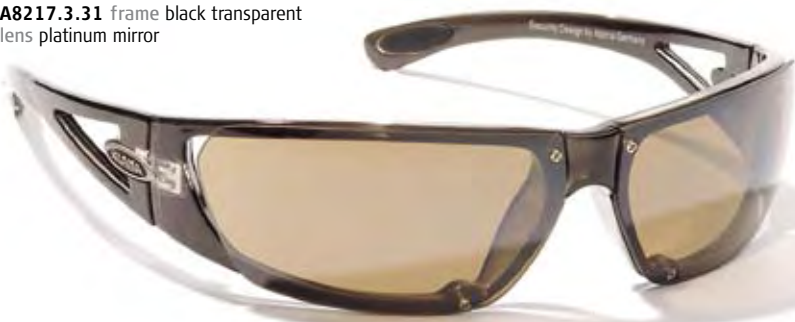
A8217.3.31 frame black transparent lens platinum mirror