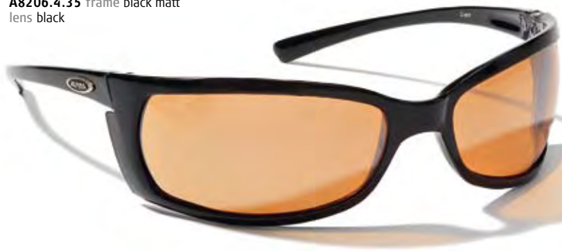
A8206.4.35 frame black matt lens black