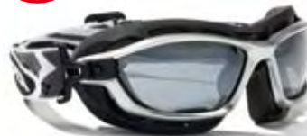
A8409.3.21 frame tin lens black mirror

HELMSTAUGLICH FIT FOR WEAR WITH HELMET SOFT FOAM GESICHTSAUFLAGE SOFTFOAM FACE OVERLAY