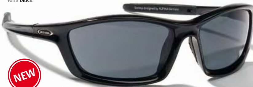
A8407.4.31 frame black lens black