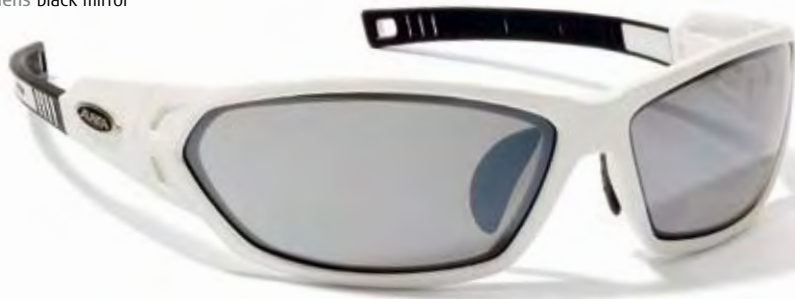
A8380.3.10 frame white lens black mirror