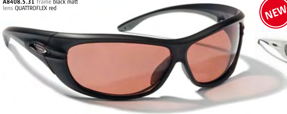
A8408.5.31 frame black matt lens QUATTROFLEX red

ANPASSBARER NASENSTEG ADAPTABLE NOSEPADS INKLINIERBARE BÜGEL ADJUSTABLE INCLINATION