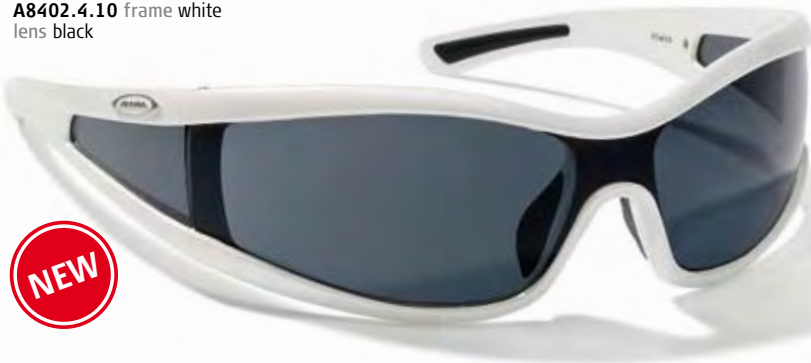
A8402.4.10 frame white lens black