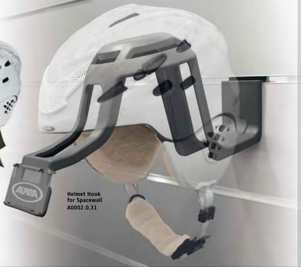
Helmet Hook for Spacewall A0002.0.31