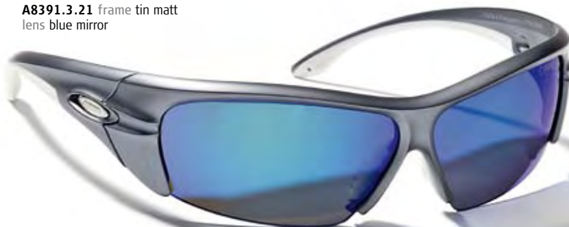
A8391.3.21 frame tin matt lens blue mirror

HELMSTAUGLICH FIT FOR WEAR WITH HELMET SOFT FOAM GESICHTSAUFLAGE SOFTFOAM FACE OVERLAY