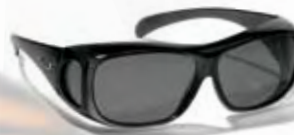
A8354.4.31 frame black transparent lens black