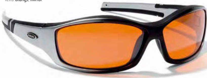
A8355.3.25 frame silver-black lens orange mirror