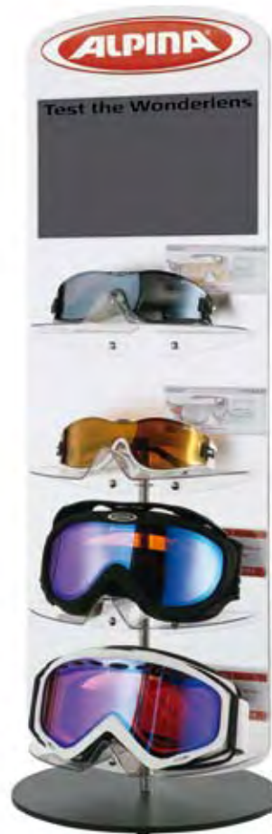
Counterdisplay QUATTROFLEX for 8 pcs A0002.0.40 68 x 23 x 23 cm incl. mirror and QUATTROFLEX tester