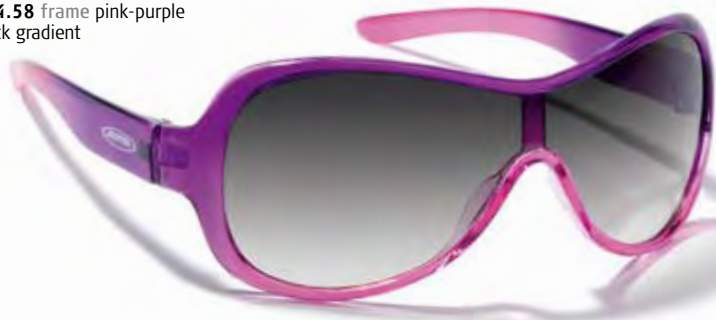
A8313.4.58 frame pink-purple lens black gradient