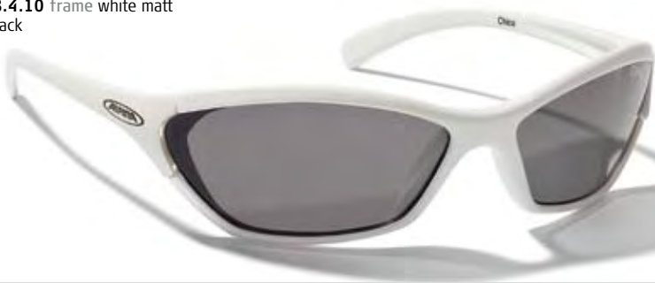
A8158.4.10 frame white matt lens black