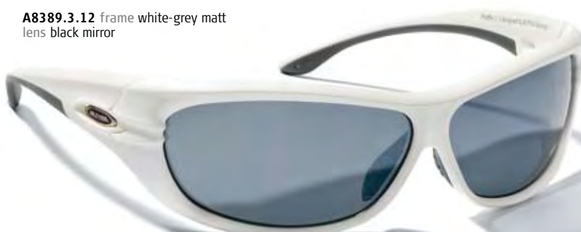
A8389.3.12 frame white-grey matt lens black mirror