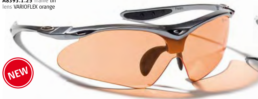
A8393.1.25 frame tin lens VARIOFLEX orange

INKLINIERBARE BÜGEL ADJUSTABLE INCLINATION > ANPASSBARER NASENSTEG ADAPTABLE NOSEPADS