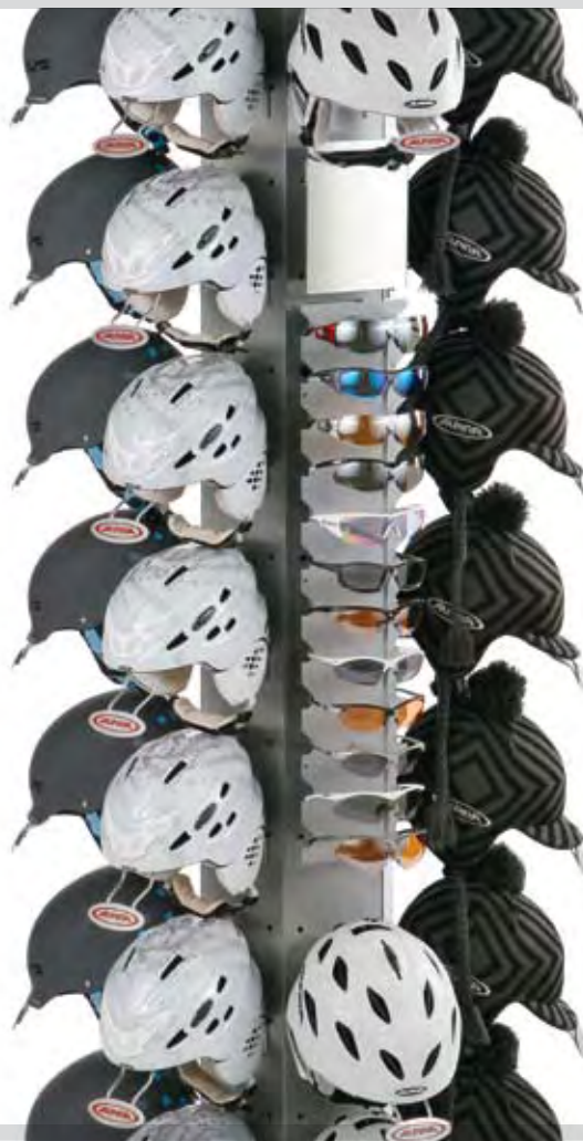
Sportsglasses Board for Helmetdisplay 41 pcs A0002.0.39 for 12 sportsglasses