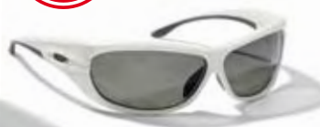
A8408.5.10 frame white matt lens QUATTROFLEX mirror black