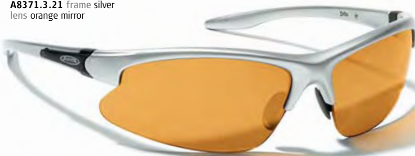
A8371.3.21 frame silver lens orange mirror