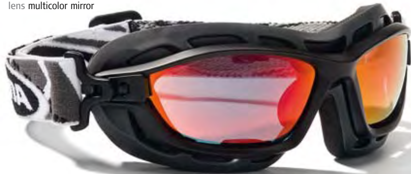
A8409.3.31 frame black matt lens multicolor mirror