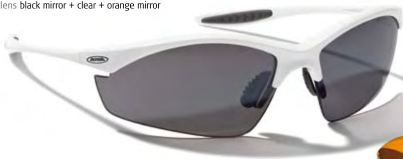
A8398.3.10 frame white lens black mirror + clear + orange mirror