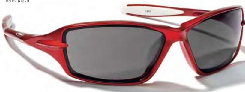
A8395.4.51 frame red lens black