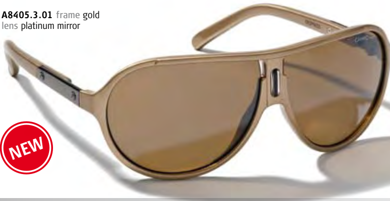
A8405.3.01 frame gold lens platinum mirror