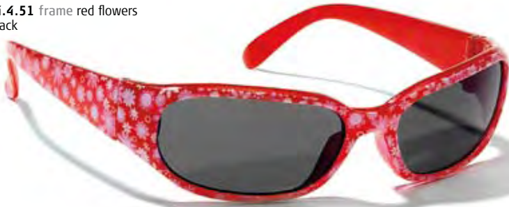
A8314.4.51 frame red flowers lens black