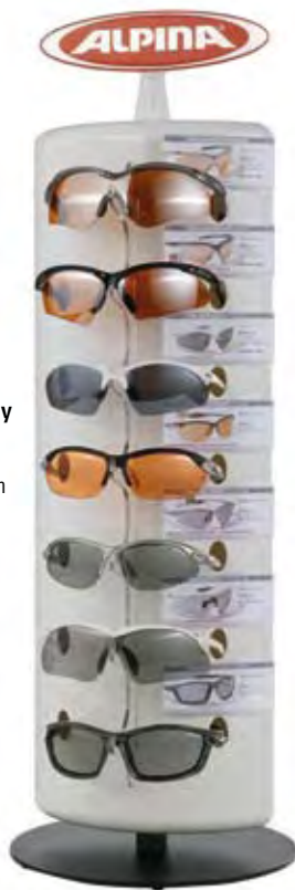
Counterdisplay for 8 pcs A0002.0.36 68 x 23 x 23 cm incl. mirror