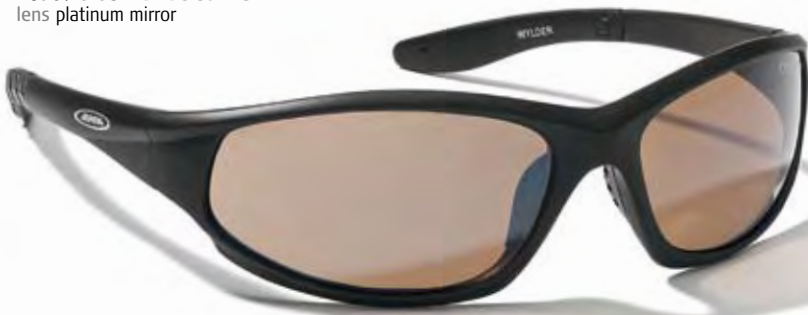
A8369.3.35 frame black matt lens platinum mirror