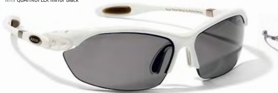
A8341.5.10 frame white lens QUATTROFLEX mirror black