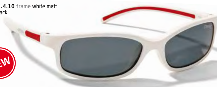
A8404.4.10 frame white matt lens black