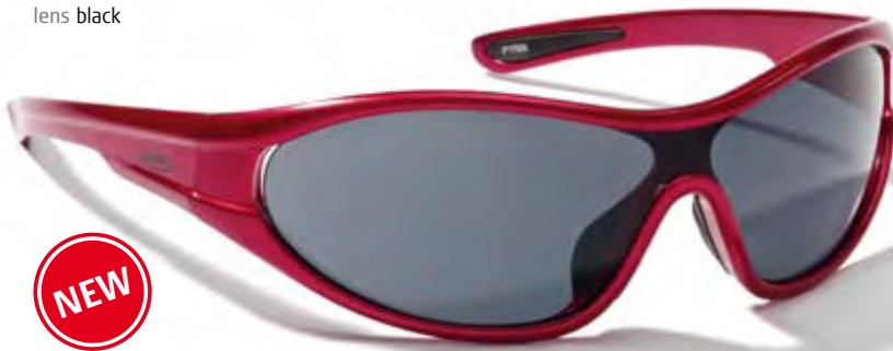
A8403.4.51 frame red lens black