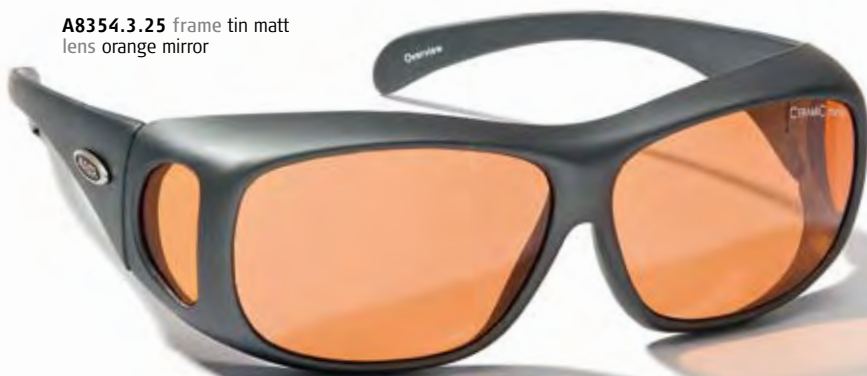
A8354.3.25 frame tin matt lens orange mirror