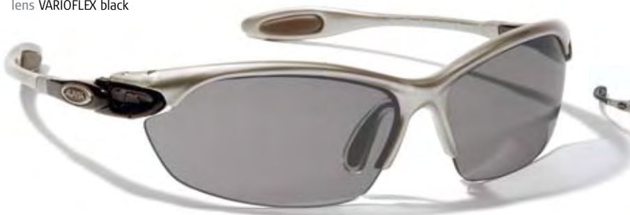
A8241.1.25 frame tin lens VARIOFLEX black

SMALL SIZE > INKLINIERBARE BÜGEL ADJUSTABLE INCLINATION > ANPASSBARER NASENSTEG ADAPTABLE NOSEPADS