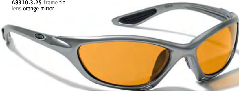
A8310.3.25 frame tin lens orange mirror