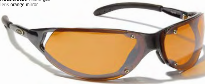
A8030.3.26 frame gun lens orange mirror