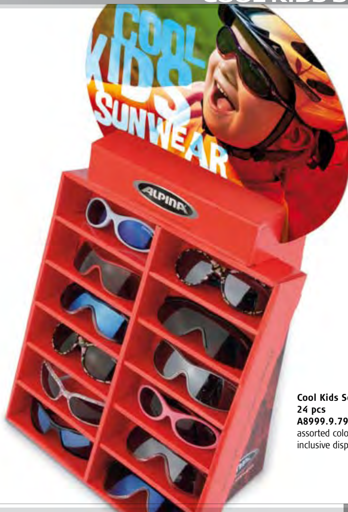
Cool Kids Set 24 pcs A8999.9.79 assorted colors inclusive display