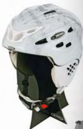
Helmet Presenter A0002.0.38 31 x 15 x 20 cm