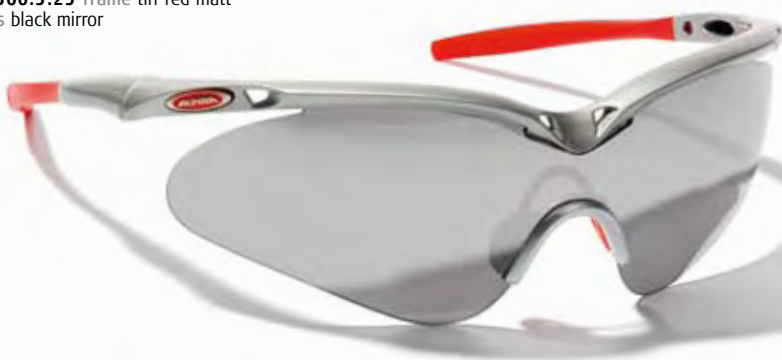
A8366.3.25 frame tin-red matt lens black mirror