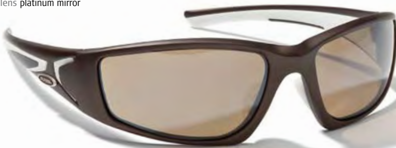
A8388.3.91 frame brown matt lens platinum mirror