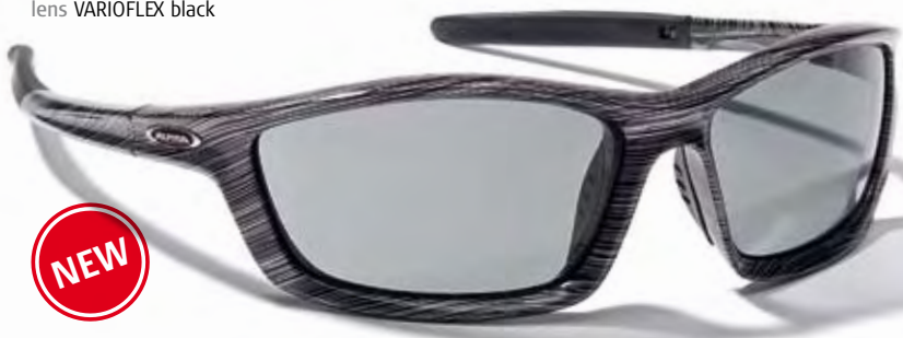
A8386.1.28 frame black-silver stripes lens VARIOFLEX black

ANPASSBARER NASENSTEG ADAPTABLE NOSEPADS