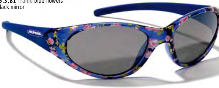
A8315.3.81 frame blue flowers lens black mirror